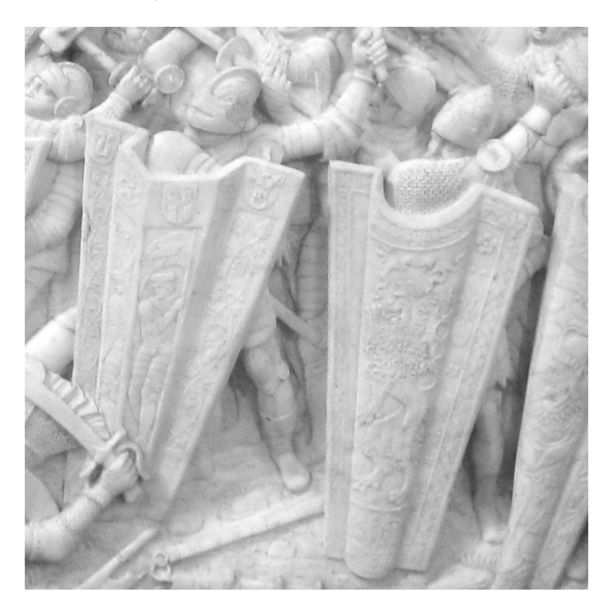
(Figure 4.2: Depiction of Bohemian pavisiers (shield-bearers) from the sarcophagus of Maximillian I, the Holy Roman Emperor (1459–1519). While shields were common in other late medieval armies, the Bohemians were known for the preponderance of pavises.(Accessed April, 2014, http://commons.wikimedia.org/wiki/File:Innsbruck_1_328.jpg)

composition of various combatants in period Bohemian infantry forces, it appears that the footsoldiers were predominantly soldiers armed for ranged combat. The royal decree from 1470 ordered feudal military mobilization for nine counties of Poděbrad-controlled Bohemia. The infantry force numbered 4450 men on paper— 3211 of which were to be marksmen. The rest were pavisiers (Figure 4.2), though these often brought their servants, which would have increased the overall numbers). 115