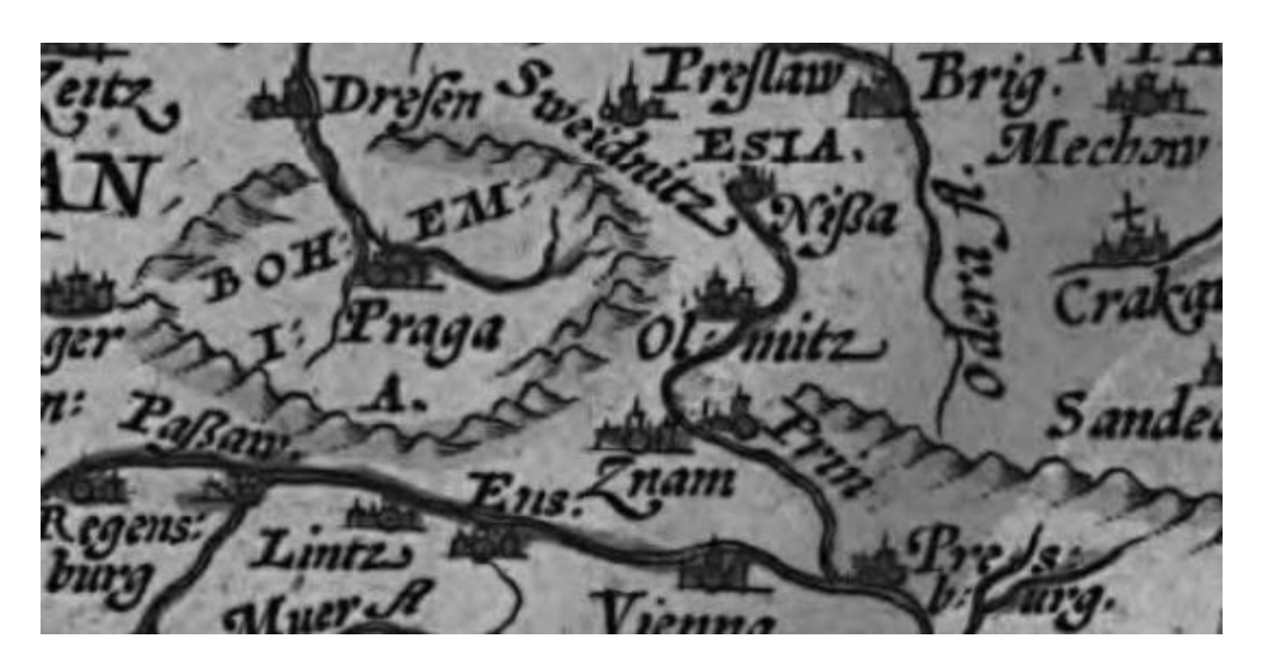
Figure 2.1: Snapshot of the Kingdom of Bohemia from Abraham Ortelius' Theatrum orbis terrarium published in 1570. Accessed September, 2013, http://www.loc.gov/item/98687183).

The former lands of the Bohemian crown<sup>31</sup> are located in the western part of what is today called Central Europe. The region is rich in forests, medium-sized hills and its other typical features are rivers and wetlands. Naturally local geography had an impact on the social, political, and cultural makeup of the medieval state. The core living areas of medieval Czechs are located in a basin and enveloped by woods and hills of the Bohemian Massif. These made a natural boundary and the first line of defense against any potential aggressor (Fig. 2.1) with forests and marshlands were favorite hideouts for both native and foreign troublemakers.