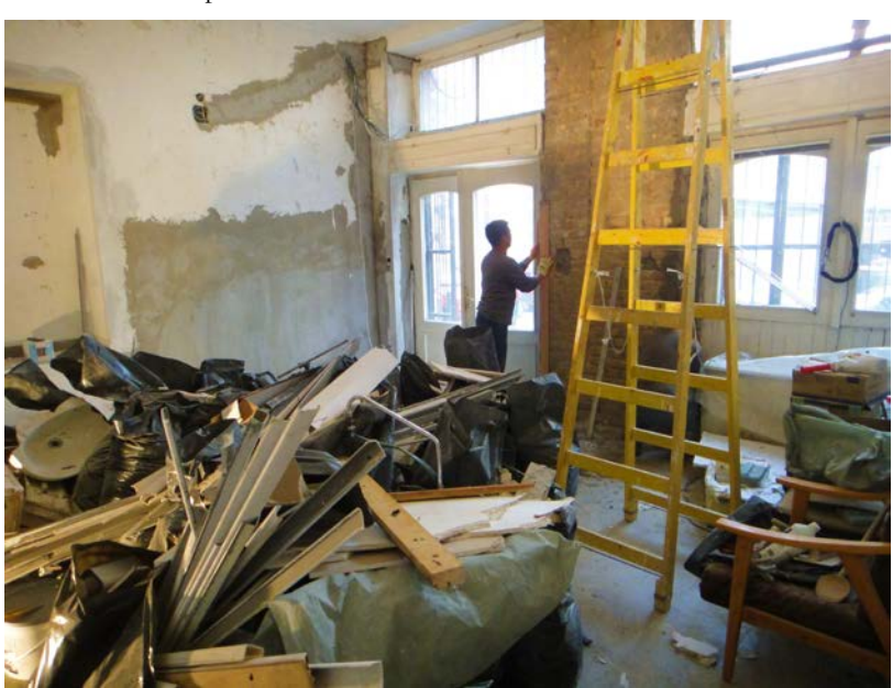
Image 4: Szatyor's Communal Space: March 2012

In expected Szatyor fashion the conversion of the space from a decrepit photo studio, into a functional store/community space/kitchen involved many hours of volunteer time, and a few timely donations of various furniture items that were acquired through connections with the Szatyor network. Nearly all of the non technical labor that was necessary to completely remove the former photo shop interior, and all of the debris that was left by the former company was completed by Szatyor members. Beyond this much of the rebuilding, and refinishing of walls, floors, and carpets was completed by members or friends of members with construction skills. Only the most technical of jobs were outsourced to professional electricians or contractors.