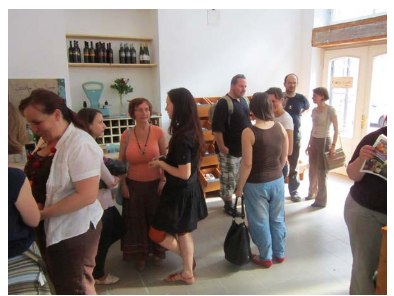
Image 5: Szatyor's Communal Space, Gyulai Pal Street Budapest: May 2012

Throughout this process great ingenuity was shown in the group's ability to make the most out of the resources that were available to them. Wood and tiles were saved and reused in to complete some of the aesthetic elements of the new space, furniture and display cases were donated from a Budapest based store who was updating its own in store display, and other creative elements to fill out the aesthetics of the new space were either hand crafted, or donated by members. The new Szatyor space is comprised of a storage and display "store" room which serves as the room for offering the products in the group's permanent inventory, along with handling the once a week pick ups. The Szatyor Bolt is new open four days a week, offering products non perishable products from the permanent inventory four days a week. An additional room is for group gatherings lies adjacent to the store, and has ample space for large gatherings, and is connected to a fully functional kitchen which makes cooking demonstrations and food preparations for events possible.