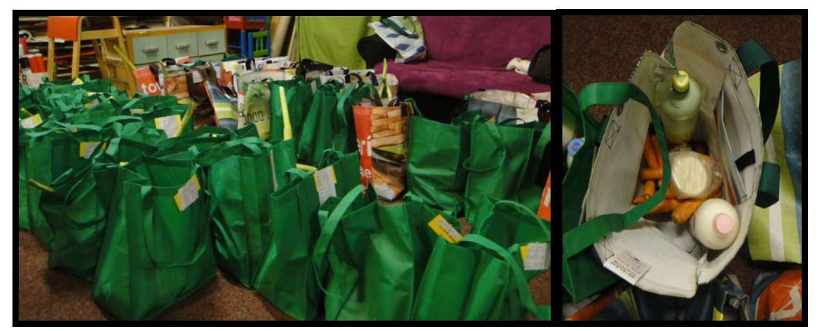
Image1: Szatyor Bags prepared for a "pick up" day

Associations two pick up location there are usually 3-4 Szatyor volunteers who turn deliveries into the separated orders, arrange the space for pick up, and managed transactions during the pick up period. Szatyor members have access to food products which are featured at prices that are both priced at a level that is both attractive to members, and equitable for producers, and members shop with the additional notion that as much of the proceeds as feasible are returned directly to the producer, as opposed to an intermediary as in traditional retail arrangements.