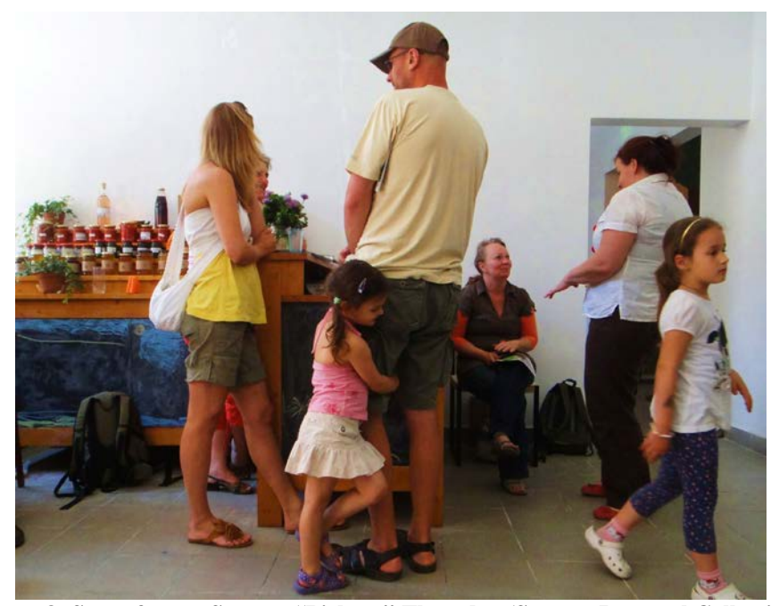
Image 8: Scene from a Szatyor "Pick up" Thursday