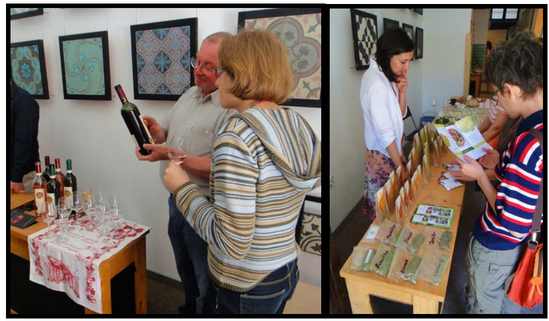
Image 6: Szatyor opening festival May 2012: Producers and members interact

up days, and on special event days. Keeping in mind Szatyor's goals to provide retail space to growers who normally have trouble finding access, and the additional interest in encouraging face to face interaction between members and producers, this stands as an integral advancement.