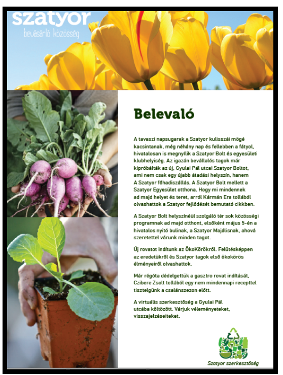
Image 3: Szatyor May 2012 Newsletter Cover