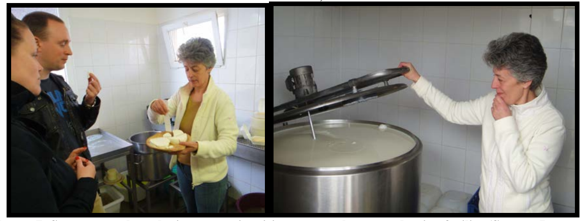
Image 7: Szatyor members during an on site visit to a goat cheese production facility