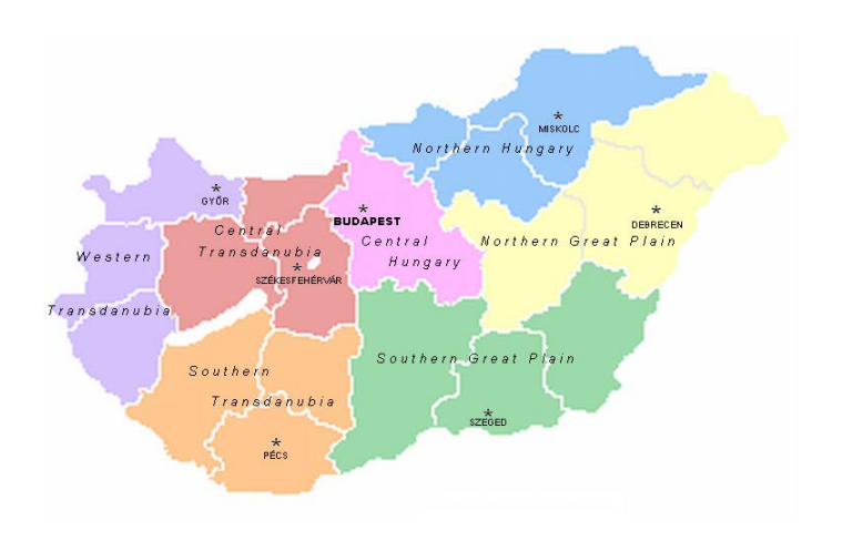
Figure 1: Developing Regional Governance Capacity: NUTS II Subregional Classifications (Kovacs 2011)

Identification of this isolation led to a greater acceptance of rural development strategies, and their interlinking with a stable agricultural sector. Once again, Hungary looked to the EU for inspiration in creating the institutional structures to encourage rural development, and in 1996 a new "Law on Regional Development and Physical Planning" was incorporated. The law was predicated on core EU principles (partnership, decentralization, subsidiarity), with the central objectives to: create conditions for self-sufficient development, improve economic conditions and quality of life within all regions, reduce gaps between capitals and other areas, and support regional and community based initiatives (Ferto 2001). While the law was predicated on these principles of development and support equity, the functional implementation of the core aims has proven to be problematic to this day. In 1998, in another important step signifying the improved governance capacity of the country, Hungary officially established 7 distinct (NUTS II) sub-regional classifications along with the support of European Union funding (Ferto 2001).