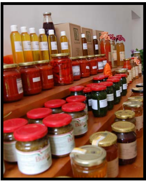
Image 2: Szatyor Permanent Inventory Sample

Szatyor currently features seasonal produce, milk, cheese, cream spreads, numerous preserved fruits spreads, jams and sauces, pickled vegetables, spices, seasonal foraged products, honey, flour, wine, fruit juice, breads, and a constantly shifting inventory of additional Hungarian specialty products produced by artisanal producers and members alike.