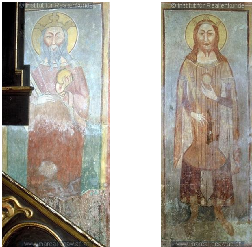
St. Stephen and St. Ladislav, Žehra

Place: The base of the triumphal arch, St Stephen on the left side, and St Ladislav on the right side.