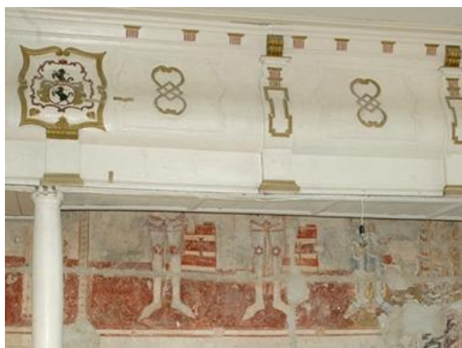
Sancti reges Hungariae, Khust

Place: The eastern side of the north wall of the nave, on the lower register.