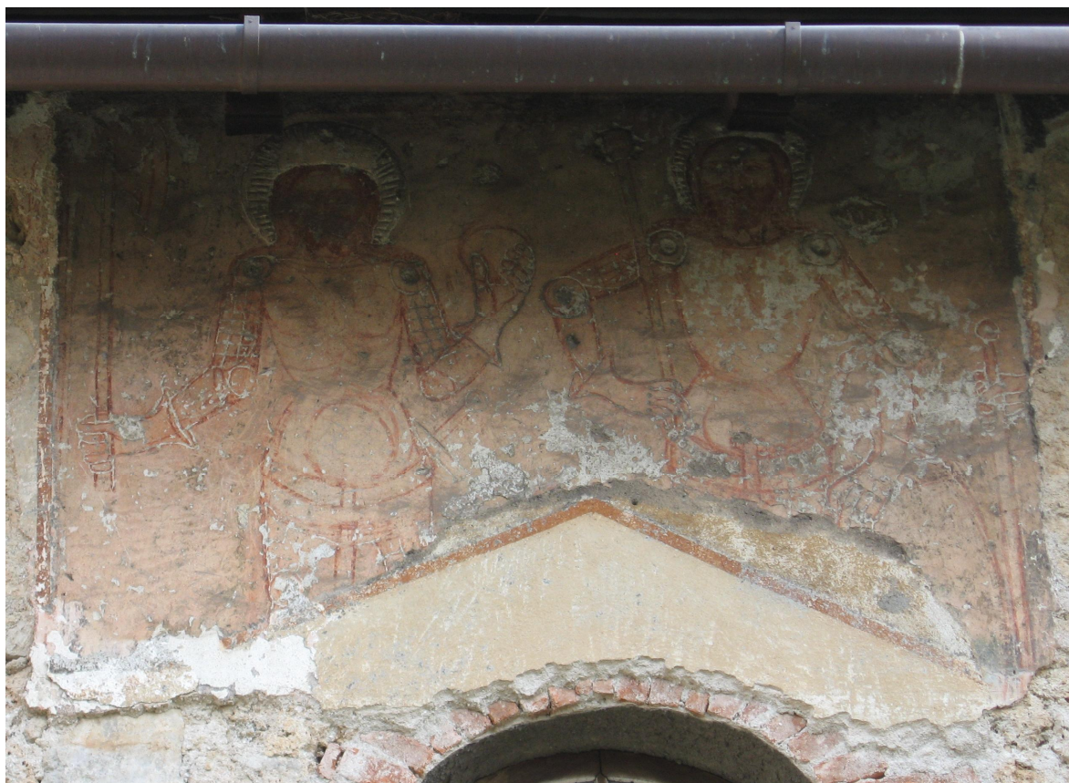
Sancti reges Hungariae, Plešivec

Place: The southern exterior wall of the choir, above the window next to the nave.