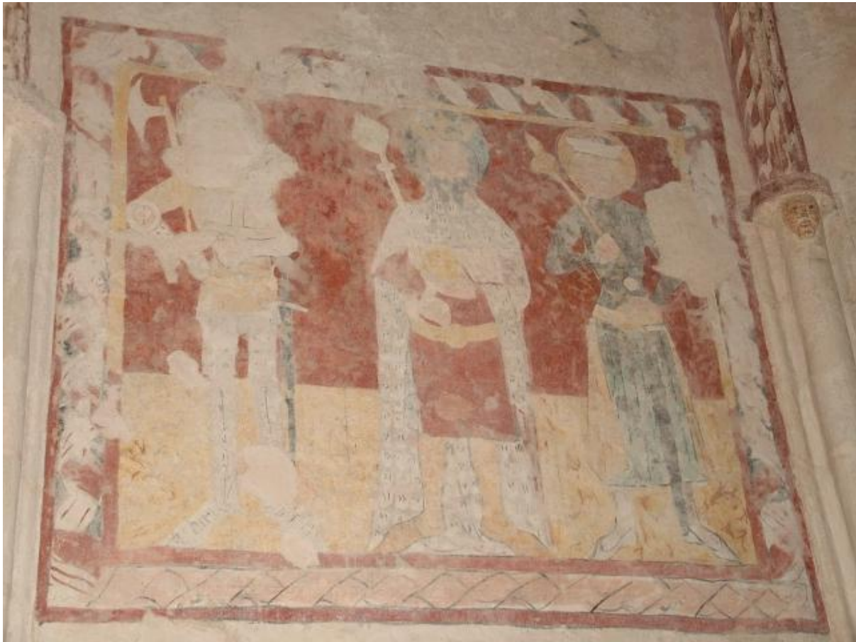
Sancti reges Hungariae, Rattersdorf

Place: On the middle register of the northern wall of the choir, on the eastern side.