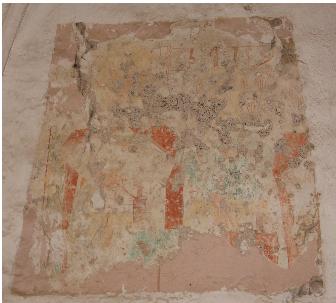
Sancti reges Hungariae, Hrušov

Place: The left side of the western wall, in the upper register.