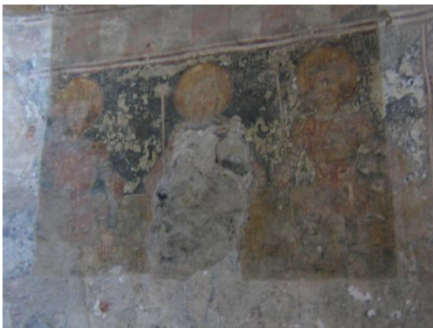
Sancti reges Hungariae, Remetea

Place: The lower register of the north side of the semicircular wall of the choir.