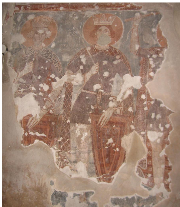
Sancti reges Hungariae, Crișcior

Place: The western side of the southern wall, on the lower register.