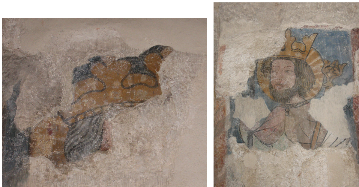
St. Stephen and St. Ladislav, Poprad

Place: The base of the triumphal arch, St Stephen on the left side, and St Ladislav on the right side.