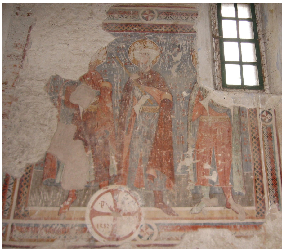
Sancti reges Hungariae, Chimindia

Place: The middle register of the southern wall of the nave, next to the choir.