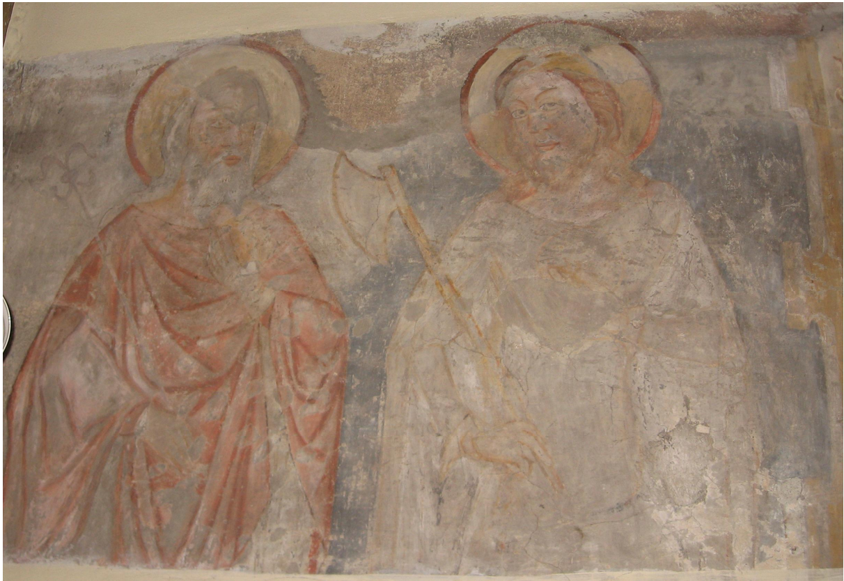
St. Stephen and St. Ladislav, Bijacovce

Place: The lower register of the northern wall of the choir, at its western extremity.