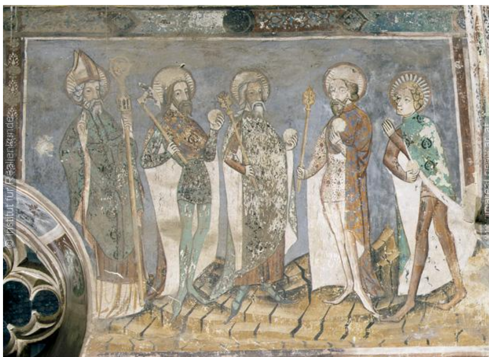
St. Gerard, St. Ladislav, St. Stephen, St. Sigismund, and St. Emeric, Mălâncrav

Place: The painting in the choir is arranged in four registers; the scene is placed on the southern wall, on the right side of the second register (counting from the top downwards), in the western bay.