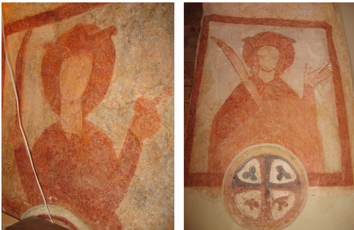
Two Holy Kings on the Pillars of the Triumphal Arch, Čečejevce