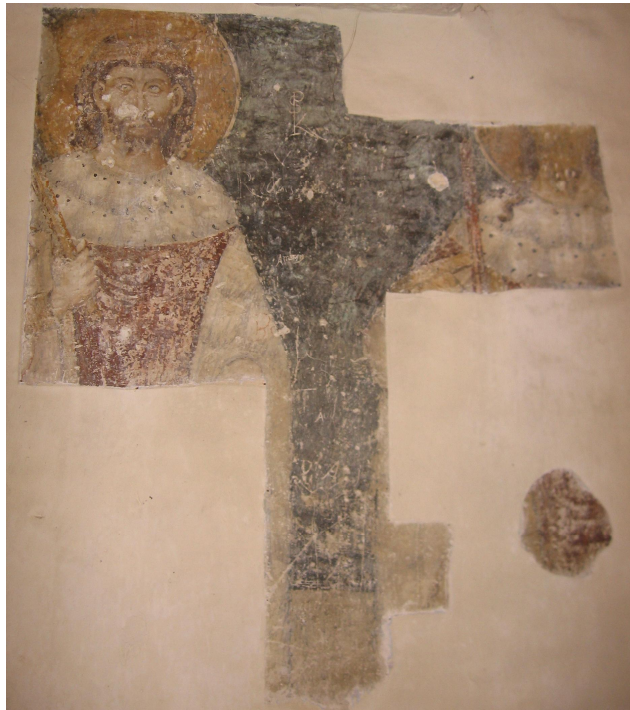
St. Ladislav and St. Stephen (?), Dârlos

Place: The lower register of the southern wall of the choir.