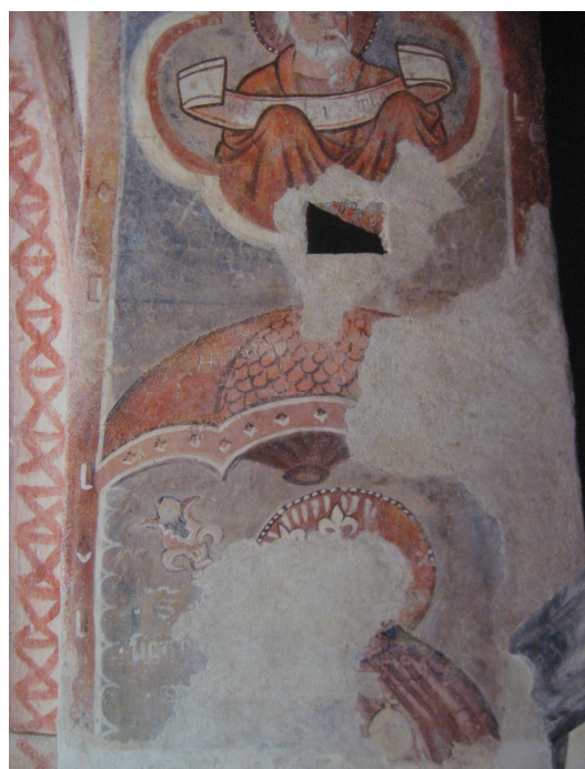
St. Sigismund and a prophet, Lónya

Place: St. Emeric and St. Stephen are depicted on the middle register of the southern wall of the choir. There is also a partially preserved representation of the St. King Sigismund at the base of the triumphal arch, on the south side, but not visible from the nave. The northern counterpart of this representation has not survived.