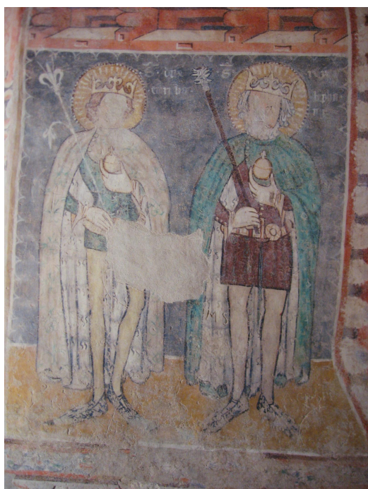
St. Emeric and St. Stephen, Lónya