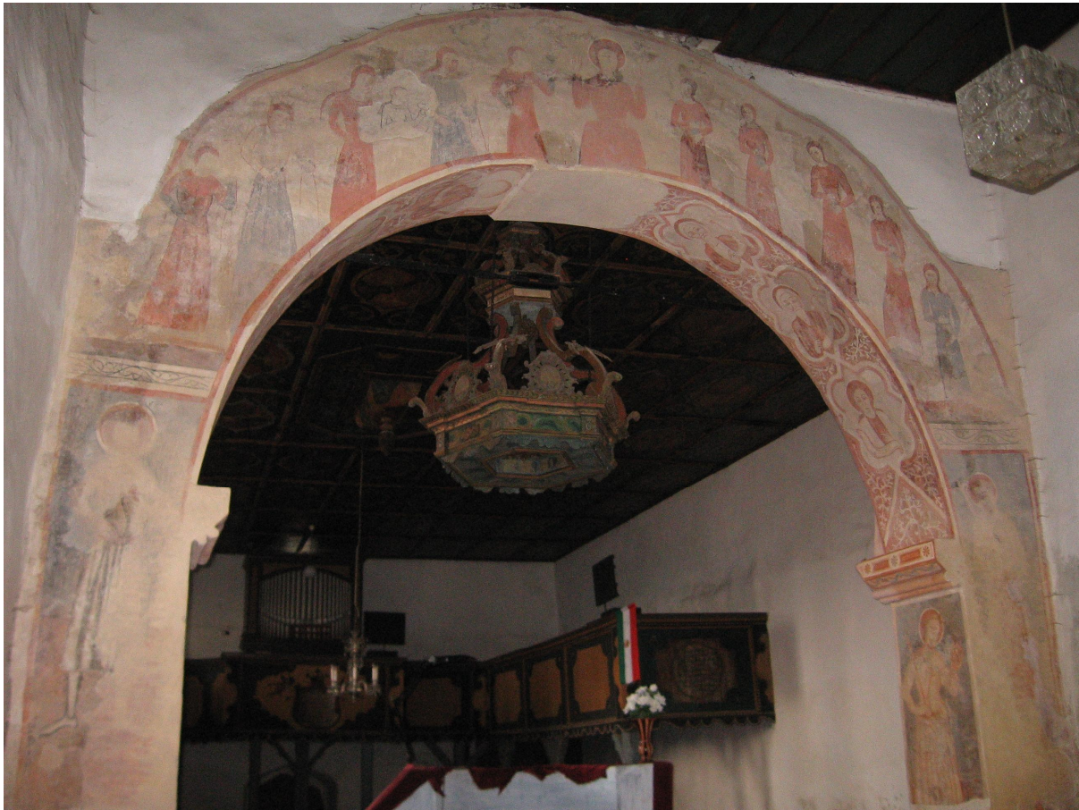
Three Holy Kings on the Bases of the Triumphal Arch, Žíp

Place: On two sides (the western and the intrados) of the pillars which form the support of the triumphal arch.