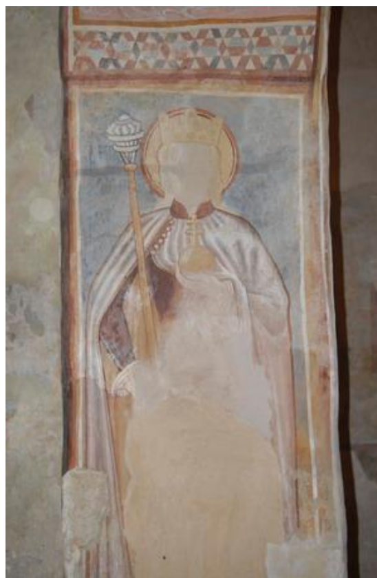
St. Ladislav and St. Stephen, Tornaszentandrás