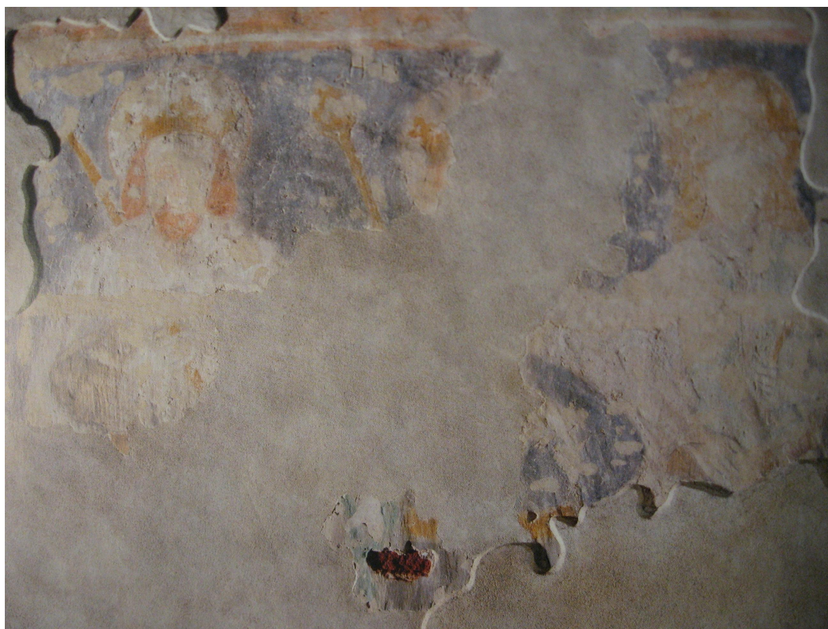
Sancti reges Hungariae, Napkor

Place: The southern pillar of the triumphal arch.