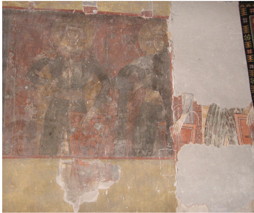
Sancti reges Hungariae, Ribița

Place: The lower register of the northern wall, in the center.