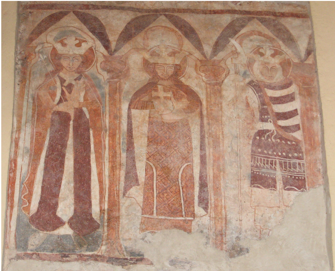
Sancti reges Hungariae, Krásnohorské Podhradie

Place: The eastern part of the north wall in the nave, on the upper register.