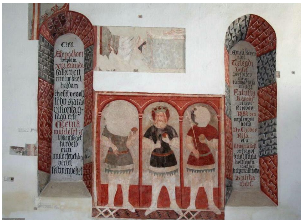
Sancti reges Hungariae, Tileagd

Place: The middle register of the southern wall of the nave, isolated between the former windows (now closed up) of the church.