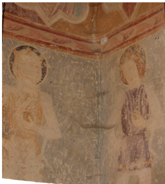
St. Ladislav, St. Stephen (southern wall), and St. Emeric (western wall), Rákoš

Place: The lower register of the murals, on the southern (St Ladislav and St Stephen) and western (St Emeric) walls of the choir.