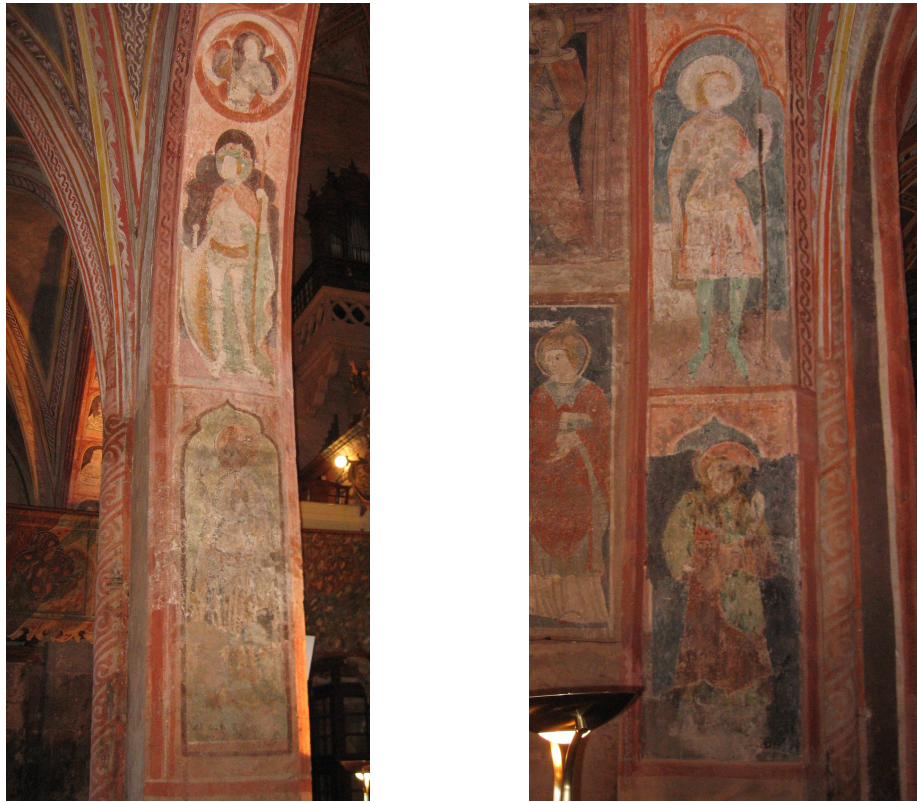
St. Ladislav and St. Sigismund (western pillar), St. Emeric and St. Stephen (?) (choir pillar), Štítnik

Place: The church is a basilica with only one pair of pillars dividing it into a nave and two aisles; each pillar is united with the western wall and the choir of the church through an arcade. On each of the two bases of the second arcade, there are two superposed representations of holy kings.